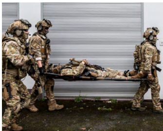
> TWO-PERSON HANDLING