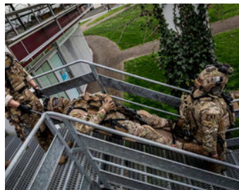
> STEPS & INCLINED SURFACES