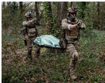
> HANDS-FREE CARRYING